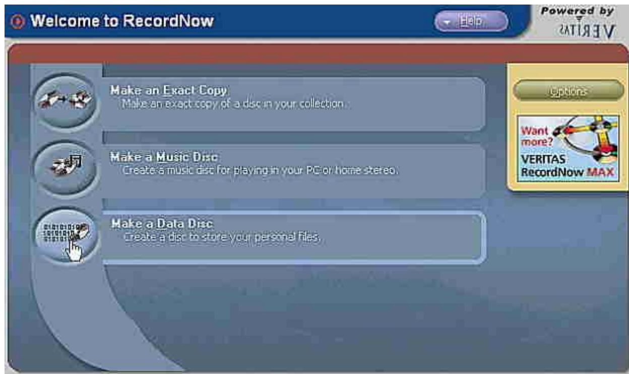
Figure 2: RecordNow main menu